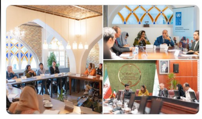
5:22 PM · Jun 27. 2023 · 705 Views

1/3 Last week #UN ASG @kanniwignaraja visited #Iran. During her 4-day visit, she met with counterparts MFA, DoE, donors & the private sector to discuss areas of cooperation in UNDP Country Programme such as climate change action, livelihoods & job generation for #youth & #women